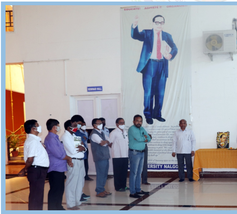
131st Birth Anniversary of Dr. B.R. Ambedkar at MGU