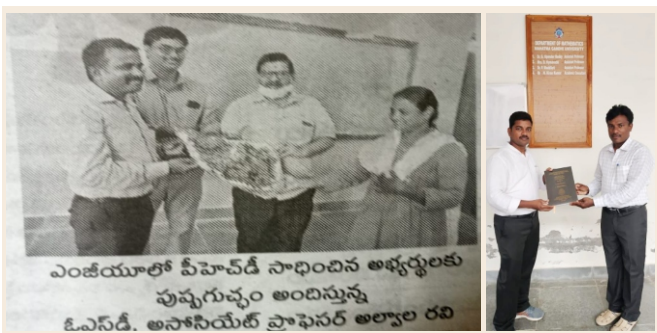
Ph.D. awardees are being congratulated by their respective research supervisors