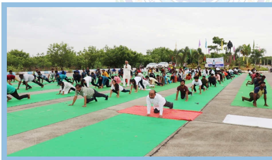
International Yoga Day Celebrations at MGU

International Day of Yoga or commonly known as Yoga Day, is celebrated on 21st June every year since its inception in 2015. Yoga is a physical, mental and spiritual practice originated in India.