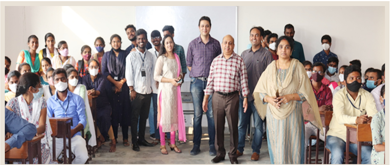
Job fair at MGU