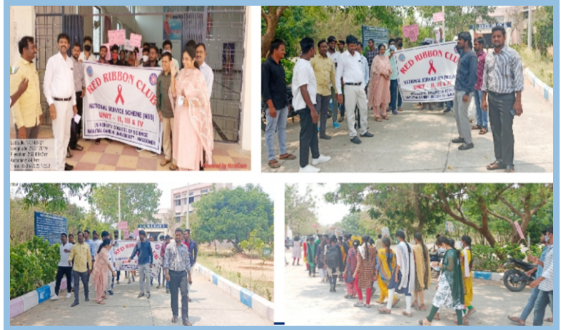
Red Ribbon rallies across the MG University constituent and affiliated colleges.